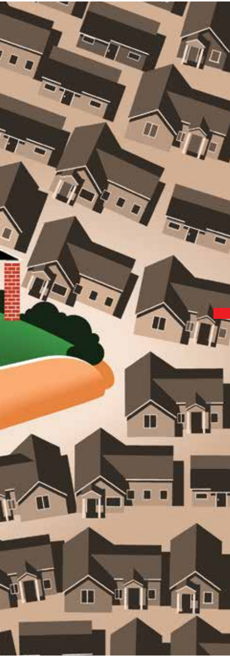
ILLUSTRATION BY JOHN W. TOMAC